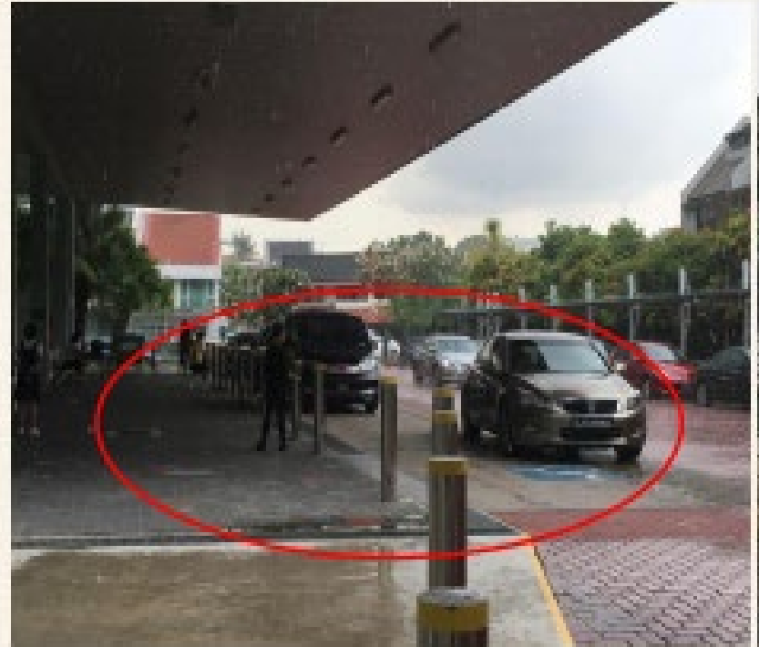
Canteen Pick Up Point for P1-P4