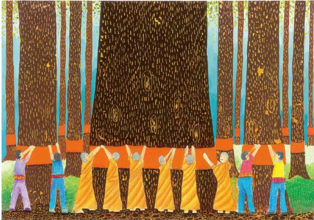
"eco together" - Planet Earth Grand Prix: "Buuat Pa" - The Buddhist ritual to conserve forest Kodchapan Malisorn (14)

KAO International Environment Painting Contest for Children